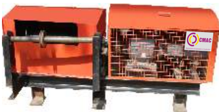
Geared Motor with Brake and Winch Mechanism