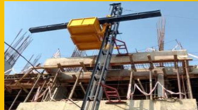
Multi Functional Hoist (MFH)-CMAC Rambo with Rebar Carrier